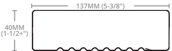
COMMERCIAL DECKING XTR-DK40-G0-PP